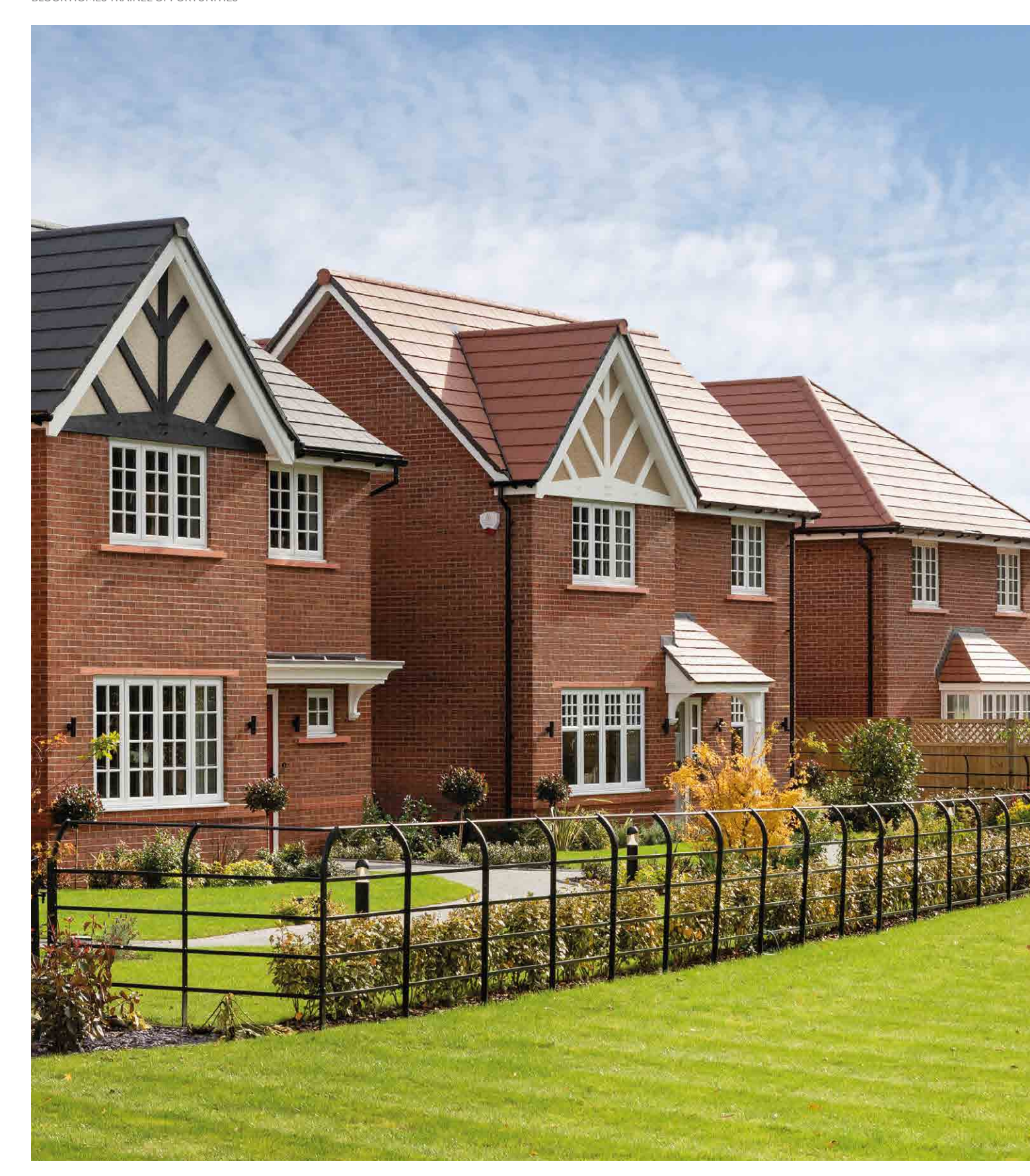
{\bf Bloor\ Homes\ sits\ proudly\ amongst\ other\ successful} companies within the Bloor Group.